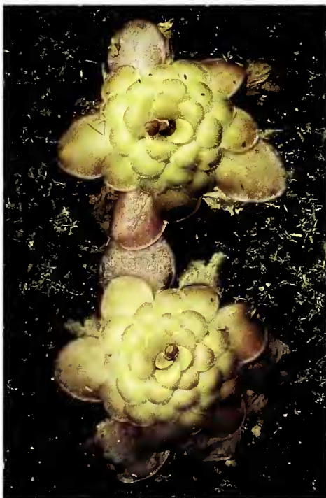
Figure 1: P. laeana , photograph by B. Meyers Rice.

JF: Keep the soil just moist year-round. Pinguicula laeana is shallow-rooted, but you should use a tall pot. This way, during the winter the pot wicks up water but the plant doesn't sit in water all the time. During the summer it can stay in a saucer of water. Use purified water like rainwater or from reverse osmosis.